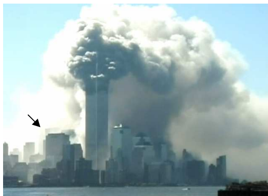
(Fig. 4) WTC 7 (arrow.)

First, the 9/11 conspirators—possibly operating out of Mayor Giuliani’s Office of Emergency Management (OEM); a reinforced, self-contained emergency command retreat built on the 23 rd floor of WTC 7 in 1999—orchestrated the collision of two Boeing passenger jets into the World Trade Center Towers. The dramatic impacts caused fires that spread throughout the upper floors of both towers and allegedly resulted in significant structural damage to the buildings’ core columns (both would later be used to explain the buildings’ unprecedented collapses).