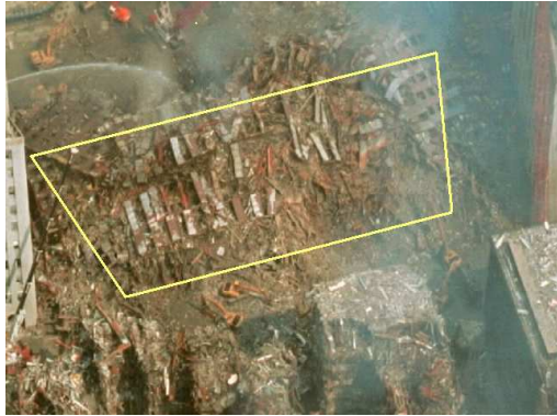
(Fig. 2) The wreckage of WTC 7.

The dramatic and well planned flights of the jets into the Twin Towers, the ensuing structural damage and fires was, to most observers, convincing “cover” for what is commonly believed to be the real cause of these buildings’ destruction—pre-planted explosives (To some, this ploy may sound familiar. The very same scheme was played out in Oklahoma City when Timothy McVeigh’s crude fertilizer bomb provided “cover” for the explosive system planted within the Alfred P. Murrah Building, a fact confirmed by myriad reports that two of the bombs in the building were found intact and subsequently disarmed). But what happened to WTC 7? Even as