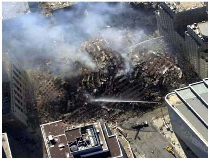
(Fig. 3) Another view of WTC 7’s wreckage looking south. The Verizon Building stands at right.

Besides this plan’s general lunacy, a compelling array of evidence points instead to its likely alternative—that the 9/11 conspirators originally intended to demolish WTC 7 earlier in the day; probably when it was being upstaged by the dramatic collapses of the Twin Towers and was completely hidden from view under a thick cloud of debris. We could nick-name this phenomenon the “Marriot Vista Hotel” effect after the 33 story building that once stood between the Twin Towers. One of seven WTC complex buildings, it was completely destroyed when the towers collapsed, and then, for all intents and purposes, vanished into obscurity.