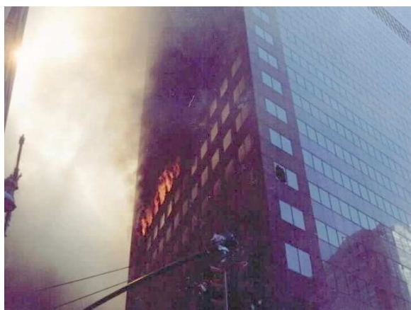
(Fig. 9) WTC 7's east face.

“Clearly the complete destruction of the WTC complex was a subplot within the overall 9/11 scheme...”