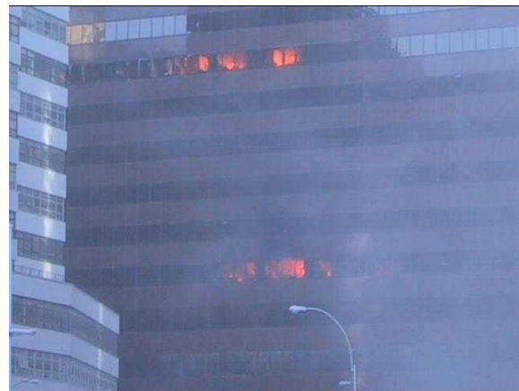
(Fig. 8) Detail of fig.7. Small fires smolder on floors 7 and 12.

After the smoke had cleared and the events of the day had been relegated to history, official claims that Tower One’s