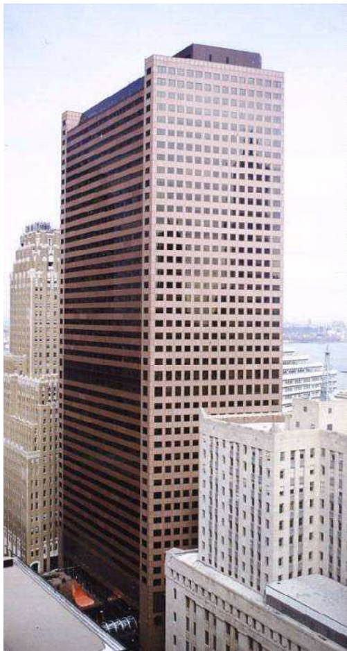
(Fig. 1) The enormous, 47 storey World Trade Center Building 7. The Verizon Building stands at left, the U.S Post Office Building at right.

If I were a gambling man I'd bet the farm. The 9/11 conspirator's original attempt to demolish World Trade Center Building 7 came shortly after the collapse of the North Tower, when WTC 7 was completely hidden under a thick cloud of debris—and the attempt was a complete failure. Whether through sabotage or malfunction, the pre-installed demolition system in Building 7 just didn't operate as planned and what was to be the swift conclusion of an elaborate plot to completely destroy the entire WTC—and, of course, provoke war with the Islamic states—proved instead to be a blunder of epic proportions.