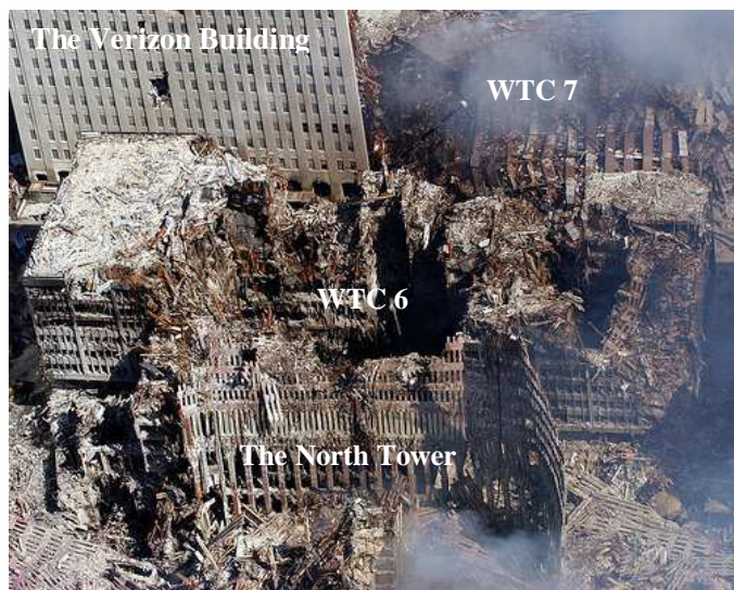
(Fig. 12) The south face of the Verizon Building stands in near pristine condition at upper left. The lack of damage to its façade seems inconsistent with the heavy damage officials claim had impacted Building 7 (right).

The debris-caused-catastrophic-damage-and-fires-to-WTC 7 theory would appear to make sense were it not for the strange lack of damage to a building right next door that logically should have sustained similar damage. Photos of the Verizon Building (standing just across a side street to the west of WTC 7) clearly show that it sustained, at best, only light damage. Despite suffering one or two minor puncture wounds, presumably from stray girders, the building remained virtually unscathed by the debris that had apparently "scooped out" a quarter of WTC 7's total depth. Site plans (fig.11) of the area confirm that debris from the collapsing North Tower should have impacted both buildings equally. But look at these aerial photos of the Verizon Building's south face (figs. 12 and 13), especially its sharp southeast corner (directly opposite WTC 7's heavily damaged southwest corner); it stands in near pristine condition—not a nick or a scratch on it. What force could so heavily impact WTC 7 and yet leave the adjacent Verizon Building virtually untouched? Some might argue that the buildings were constructed of different materials, but one would think that any wreckage that allegedly caused such profound damage to WTC 7 would surely have left its mark on its cozy neighbor, no