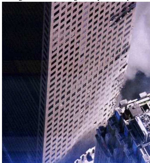
(Fig. 10) The damage sustained by WTC 7’s southeast corner. The Verizon Building’s roof can be seen in the lower right-hand corner.

What a mistake to think of the 9/11 conspirators as criminal masterminds. Imagine their state of mind as they watched their plan to destroy one of the world’s most famous landmarks (and, of course, violently murder thousands of innocent people) unfold before their eyes. Even the most jaded covert operative wouldn’t likely remain un-rattled after having perpetrated such an outrage. And don’t forget, they had very similar performance problems in OK City. Certainly we