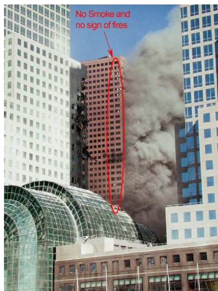
(Fig. 14) Was the smoke pouring out of WTC 7 the result of debris damage from the North Tower's "collapse" or an explosion from within Building 7?

The only explanation that's ever been offered by anyone in Silverstein's defense is that he used the word 'pull' to indicate instead the cautious evacuation of WTC 7's perimeter in the event of another unprecedented collapse. But I believe that this usage of 'pull' is just as damning, and this is why: For these guys to 'pull,' (clear the area around) Building 7 and then have it fall right on cue, when physics doesn't support the phenomenon, the building was, at best, only marginally involved and no steel-framed building has ever collapsed because of fire (except on 9/11 when it happened three times) is all simply too much of an implausibility to take seriously. Also, officials involved in the FEMA and NIST investigations into the odd collapse of WTC 7 specifically stated that "there was no fire fighting in WTC 7" to begin with. Under the circumstances, the ruse that Silverstein used the word 'pull' to mean evacuation, not demolition, just ends up looking like spin, pasted into place after his crude "hang-out" attempt on prime-time TV backfired and created more suspicion than it dispelled. This, and several other compelling points, wholly tie Silverstein into the suspicious events of the day at the highest levels and