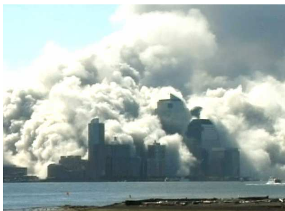
(Fig. 6) The North Tower’s debris cloud rises to almost twice the height of WTC 7.

The conspirators then turned their attention to the explosive demolition of the Twin Towers and Building 7. The first step in this phase of the plan would be the arming and programming of the explosive system previously installed within the tower furthest from Building 7 and the OEM bunker; the safely distant South Tower or WTC 2. When this had been done, the conspirators then awaited the optimum moment for detonation, a time when the South Tower’s “collapse” would be reasonably believable to most people. When that moment finally arrived, the plotters brought the South Tower down in a dramatic progressive