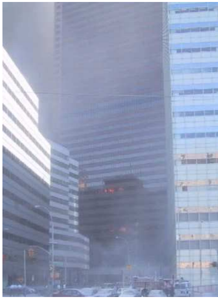
(Fig.7) WTC 7's tiny fires photographed at approximately 3 PM.

“...they chose this moment to exit Building 7 altogether and prepare for the near simultaneous demolition of the North Tower and WTC 7 from a secondary location.”