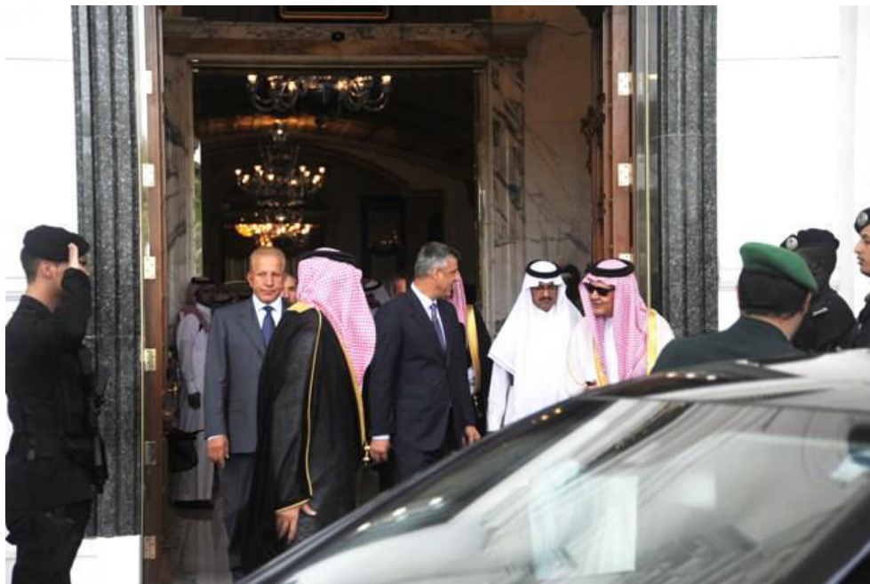
Kosovo warlord Hashim Thaçi in Saudi Arabia to meet King Abdullah to solicit money.

mosques all over tiny Bosnia and now in Kosovo, to spread the strict fanatical Saudi Wahabist Islam in a region where Muslims had been, by tradition, moderate and peaceful. In Sarajevo, the capitol of Bosnia, they built a grandiose $30 million King Fahd mosque. Saudi mosques, which began appearing all over Bosnia-Herzegovina and Kosovo, were complete with Saudi fanatical Wahhabite Imams who preached the fundamentalist Jihad ideology. As a US-backed Prime Minister, Hashim Thaçi encouraged the Saudi connection, especially Saudi money. 25