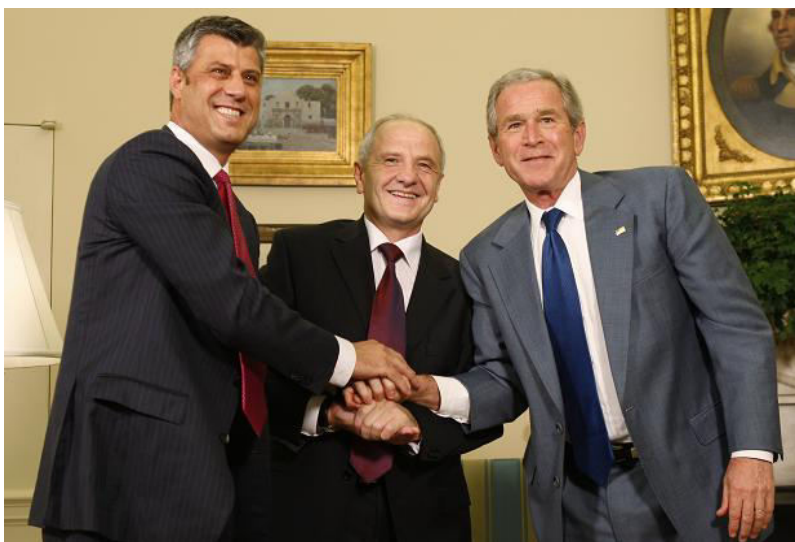
President of the US George W. Bush shakes hands with Kosovo President Fatmir Sejdiu (center) and Kosovo Prime Minister Hashim Thaçi (left) during a meeting in the White House on July 21, 2008, after Kosovo declared independence.

formal authority of the United Nations, the Organization for Security and Cooperation in Europe (OSCE) had the task of training and installing a 4,000-strong police force with a mandate to “protect civilians” under the jurisdiction of the KLA-controlled “Ministry of Public Order.” The KLA-controlled police force was also responsible for the massacres of civilians organized in the immediate wake of NATO’s military occupation of Kosovo. 28